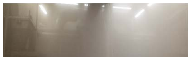
Fig. 4: Uniform distribution of the active ingredient during shock sterilization