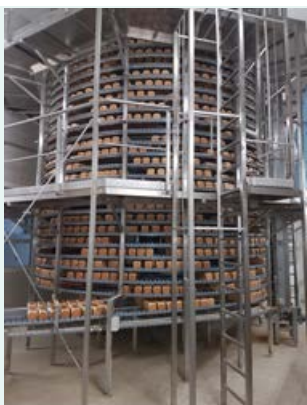
Fig. 2: Treated cooling area [Room I]

Room size: approx. 2,250m 3 Pressure: approx. 4.5 bar Nebulization time: approx. 40min. total duration Sedimentation time: approx. 30min. total duration Consumption: approx. 22kg food-protect ®