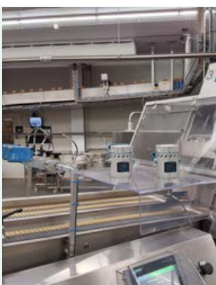
Fig. 3: Treated cooling area [Room II]

Room size: approx. 1,370m 3 Pressure: approx. 4.5 bar Nebulization time: approx. 4min. total duration Sedimentation time: approx. 30min. total duration Consumption: approx. 14kg food-protect ®