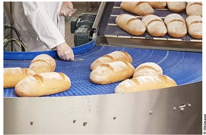
Fig. 5: Sampling of the surface in contact with product inlet packaging of whole loaves in Room II

Another hygienic effect of fogging is the simultaneous hygienic protection of room fixtures such as cable ducts, pipelines, strip lighting, control cabinets, etc.