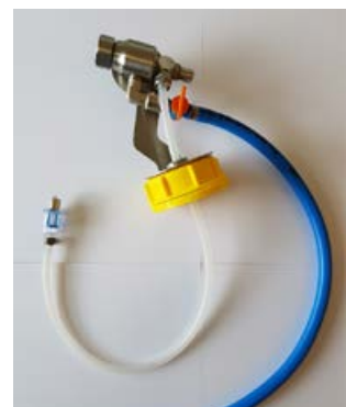
Fig. 1: Technical design of the cover nozzle – detailed view

In the practical study, the room to be treated in each case is sanitized after cleaning (shock disinfection) and the hygiene status is then maintained by means of a continuously targeted application (maintenance sanitization) to ensure the hygiene of surfaces (e.g. cutting machine, conveyor belts, ventilation