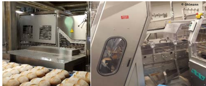
Figs. 6 and 7: Peripheral fixtures after baking/cooling/confectioning

The H 2 O 2 [ppm] content in the air is below the occupational exposure limit when food-protect® is used properly and professionally after shock disinfection as well as when it is used